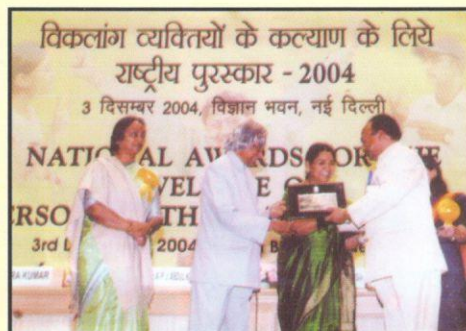
2004: President's Award for Centre for the Disabled