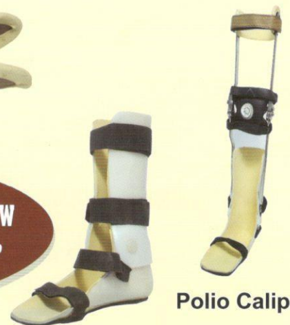
A.F.O. Ankle Foot Orthosis