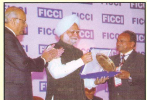
2007: F I C C I Award by Prime Minister